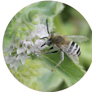
Anthophora spp. (Digger Bees)

A more widespread closely related species, looks similar and flies May-June in most of its range.