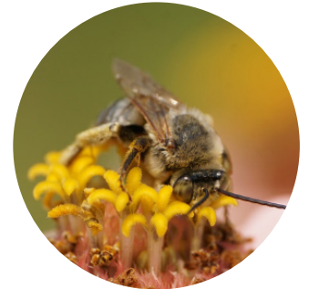
Svastra obliqua expurgata (Western Oblique Longhorn Bee)

Fast-flying, hairy bees. Fly late spring-fall. Distinguished from T. gummifera by small mandibles, and females have pollen-collecting hairs on legs, not underside of abdomen.