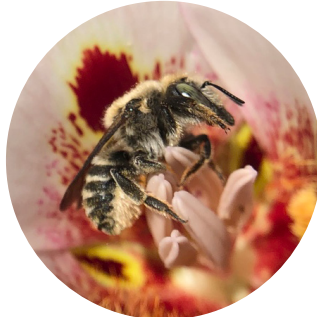
Trachusa perdita (California Resin-Leaf-cutter Bee)

Rare bee found in Marin County after decades. Shown for comparison, NOT a common bee.