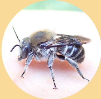
T. gummifera (San Francisco leaf-cutter bee)

Rare bee found in Marin County after decades. Shown for comparison, NOT a common bee.