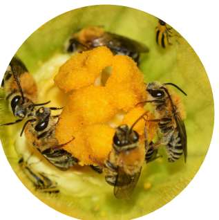
Eucera (Peponapis) pruinosus (Squash Bee)

Medium to large leaf-cutter bee that flies summer-fall.