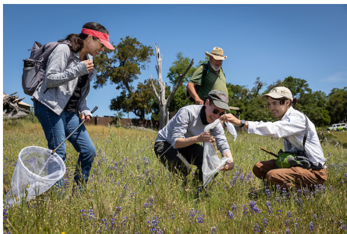
Volunteers look for bees to document for the California Bumble Bee Atlas.

A: Stay tuned! Our Tamalpais Bee Lab season has concluded for 2024, and we're planning next steps.