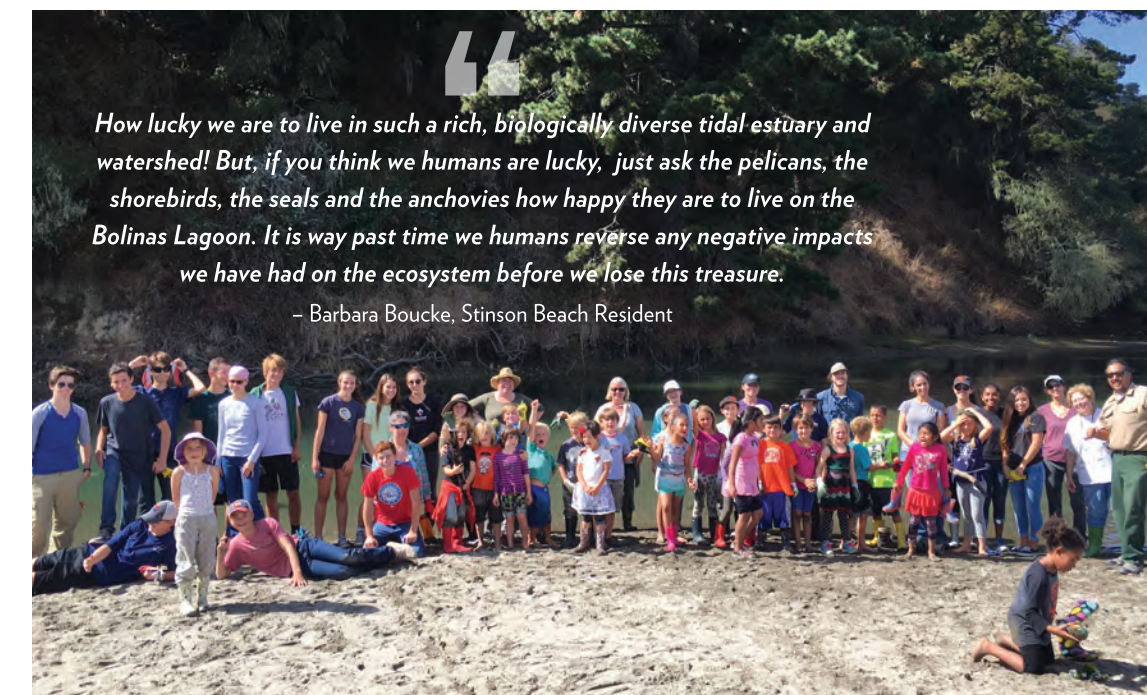
Community volunteers are continuing a long tradition of caring for Bolinas Lagoon by helping remove invasive species and restore native habitats on Kent Island.

Future climate change and sea level rise will further test these fragmented habitats and challenge both human and wildlife residents to find new ways to adapt and survive.