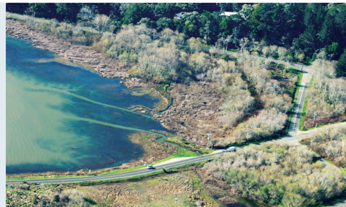
The Bolinas "Y" intersection at the north end of the lagoon is an example of how roadway development fragments habitats and prevents the lagoon from shifting in response to sea level rise.

BOLINAS LAGOON has existed in a state of constant change for over 7,000 years, as winds, waves, tides, and earthquakes sculpted its complex network of habitats. Yet, in less than 200 hundred years, human land-use changes have altered the lagoon's ability to shift with these natural processes. Climate change, and its accompanying storm surges, high tides, and sea level rise, will further challenge the lagoon's ability to adapt, threatening both its built and biological systems.