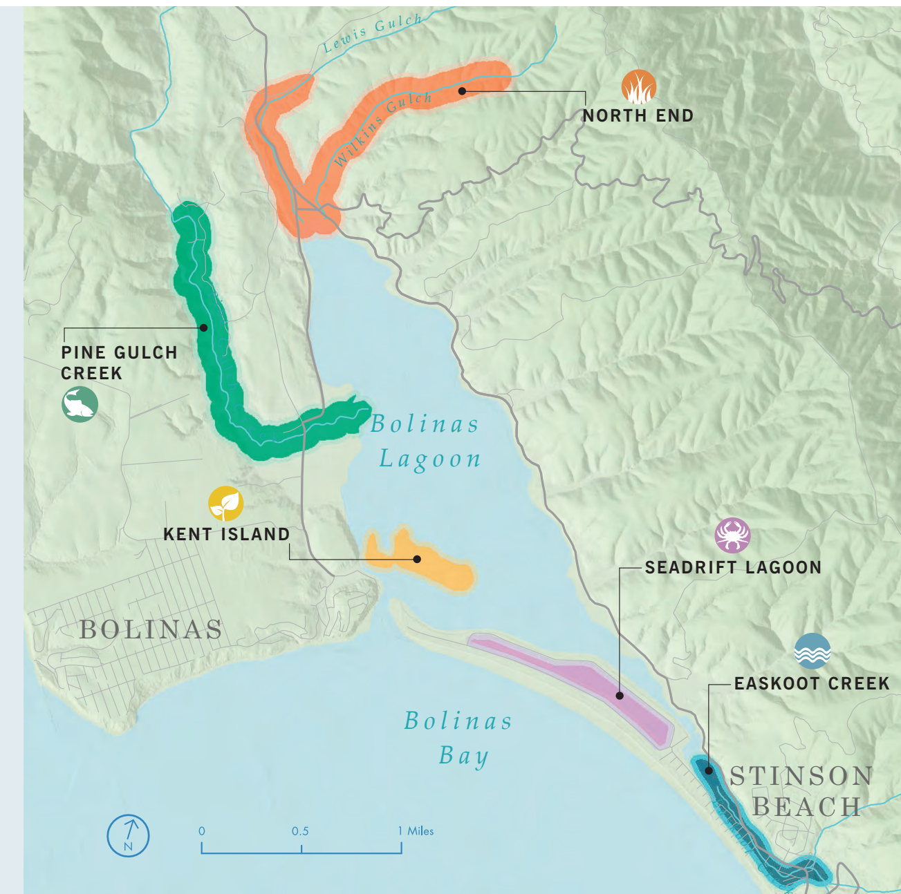
*Projects here represent some of the priorities identified in the Bolinas Lagoon Ecosystem Restoration Project: Recommendations for Restoration and Management .