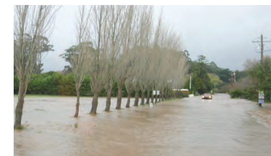
Without restoration, flooding on Olema-Bolinas Road will continue to worsen as sea levels rise.

Today, we are putting that vision into action and you can help! Residents, public agencies, local organizations, and other stakeholders are working together to restore habitats, protect wildlife, keep roads safe, and preserve the lagoon's stunning natural beauty. Numerous studies and ongoing monitoring of physical processes, habitat, and wildlife support these projects and help guide future planning.