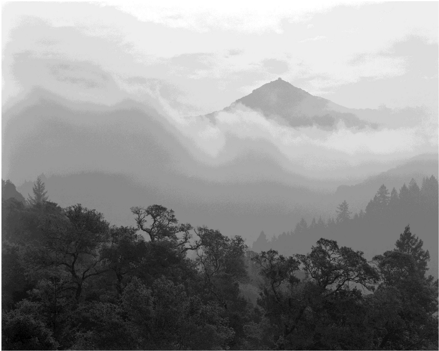
Early Mountain Mist, 2010