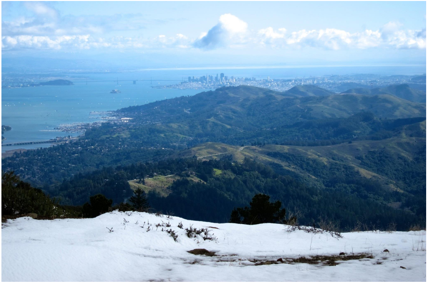
Snow on West Peak, 2011