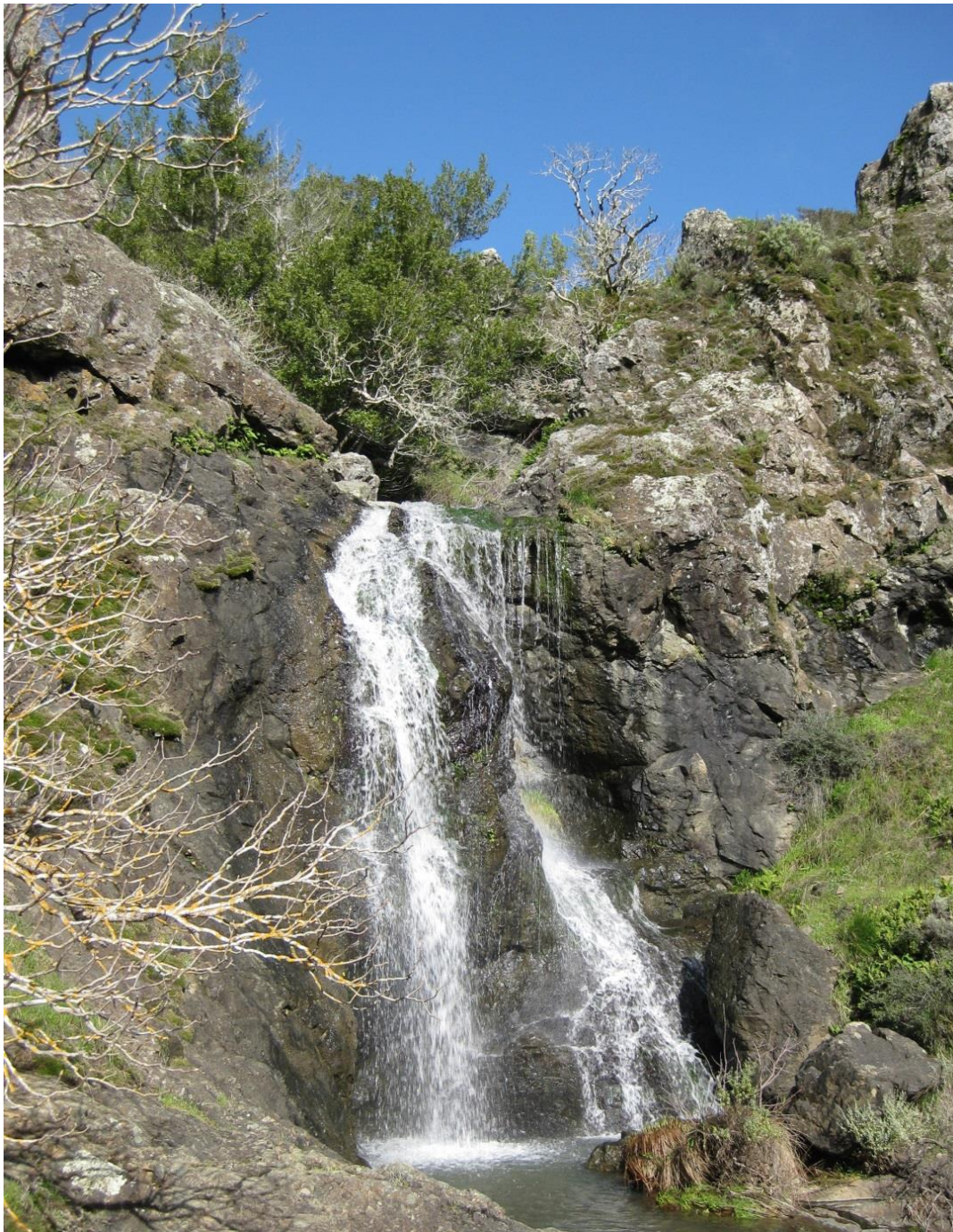
Carson Falls, 2010