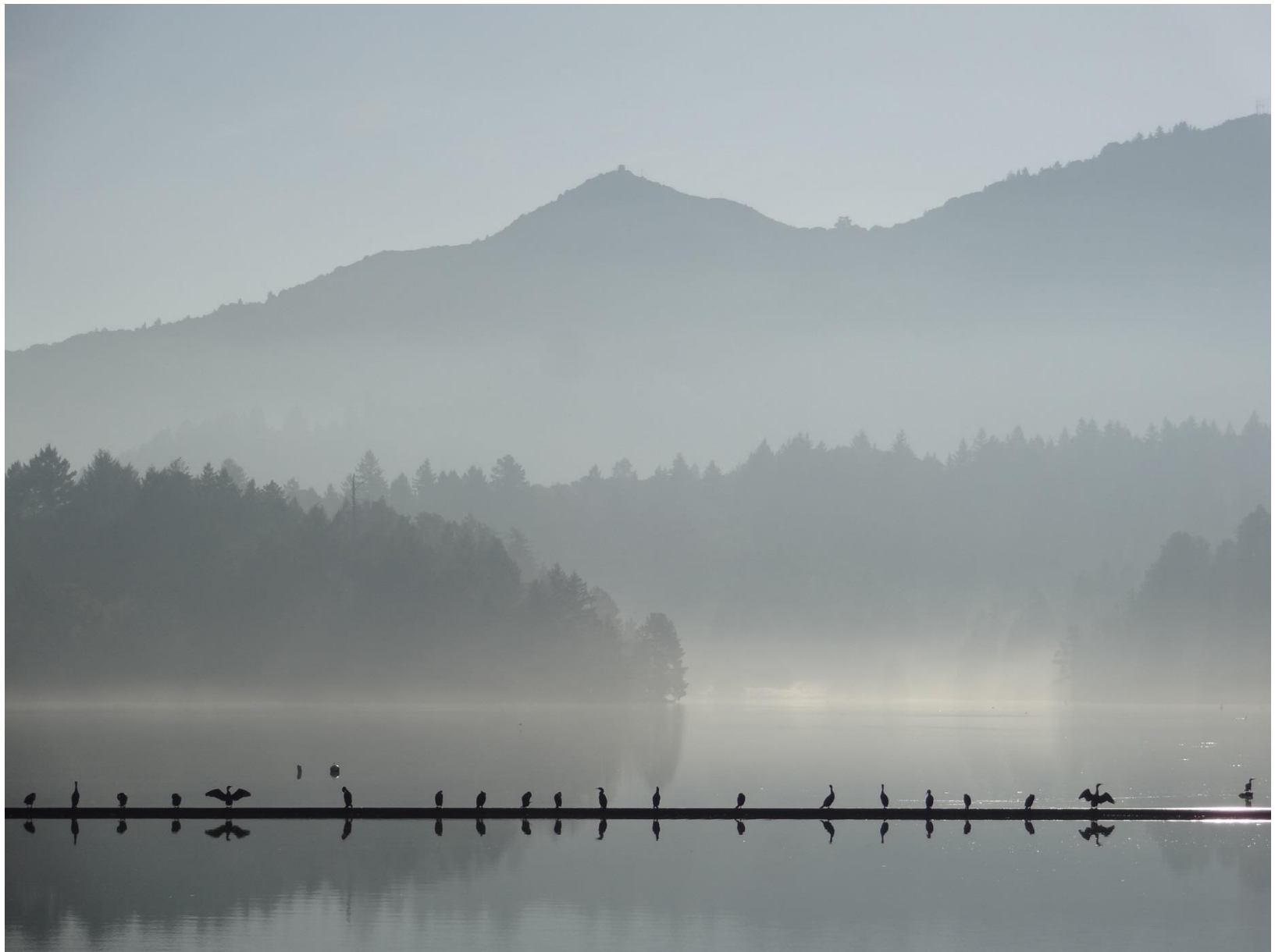
Bon Tempe Cormorants, 2013