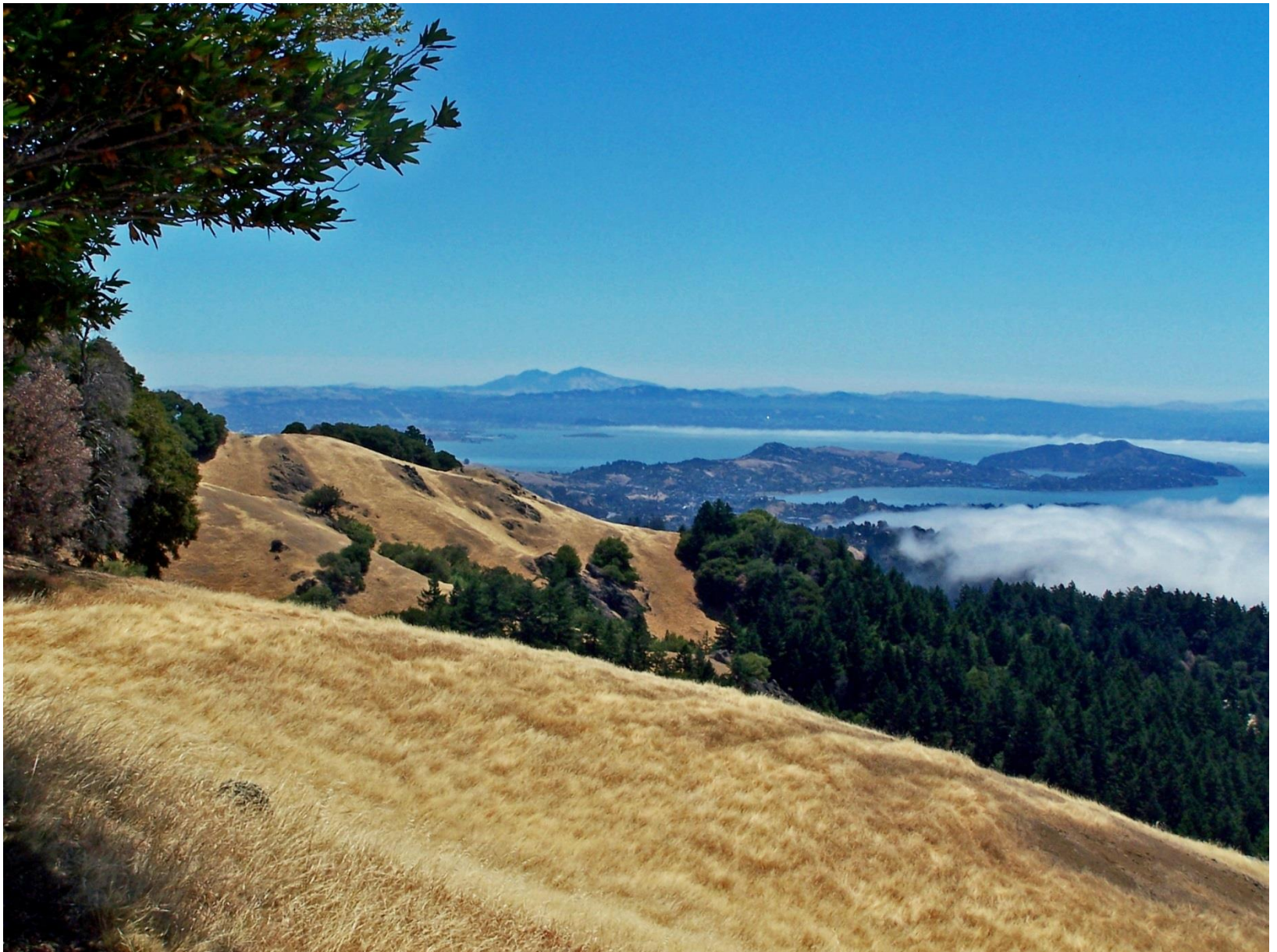
Mount Diablo from Mount Tam, 2008